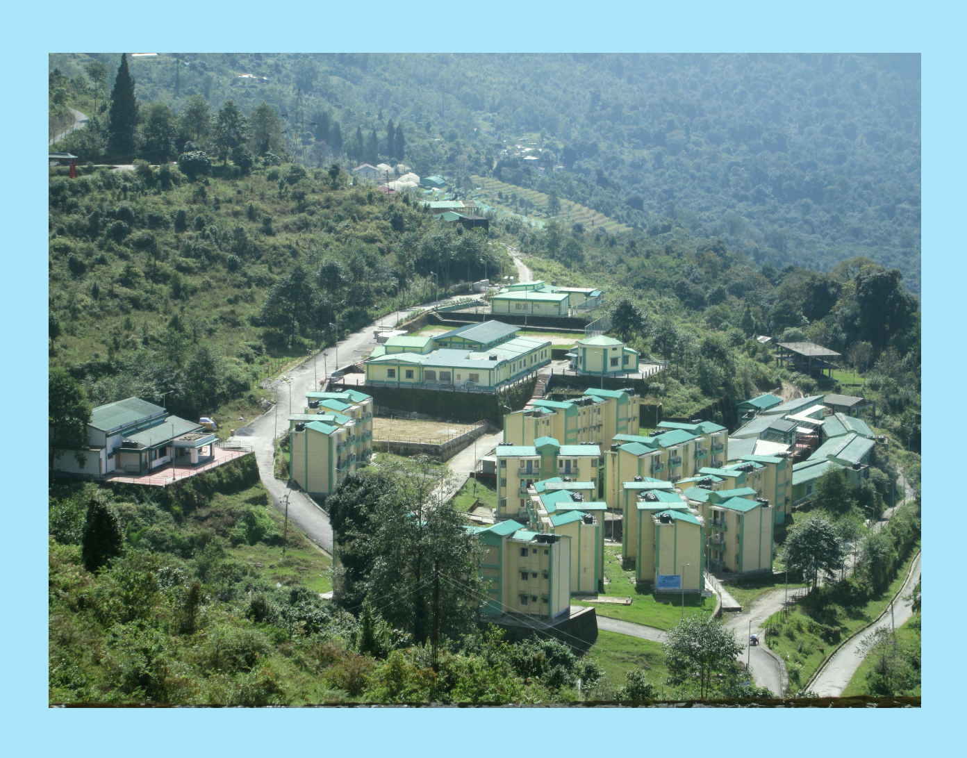
THE INSTITUTE: BIRD'S EYE VIEW