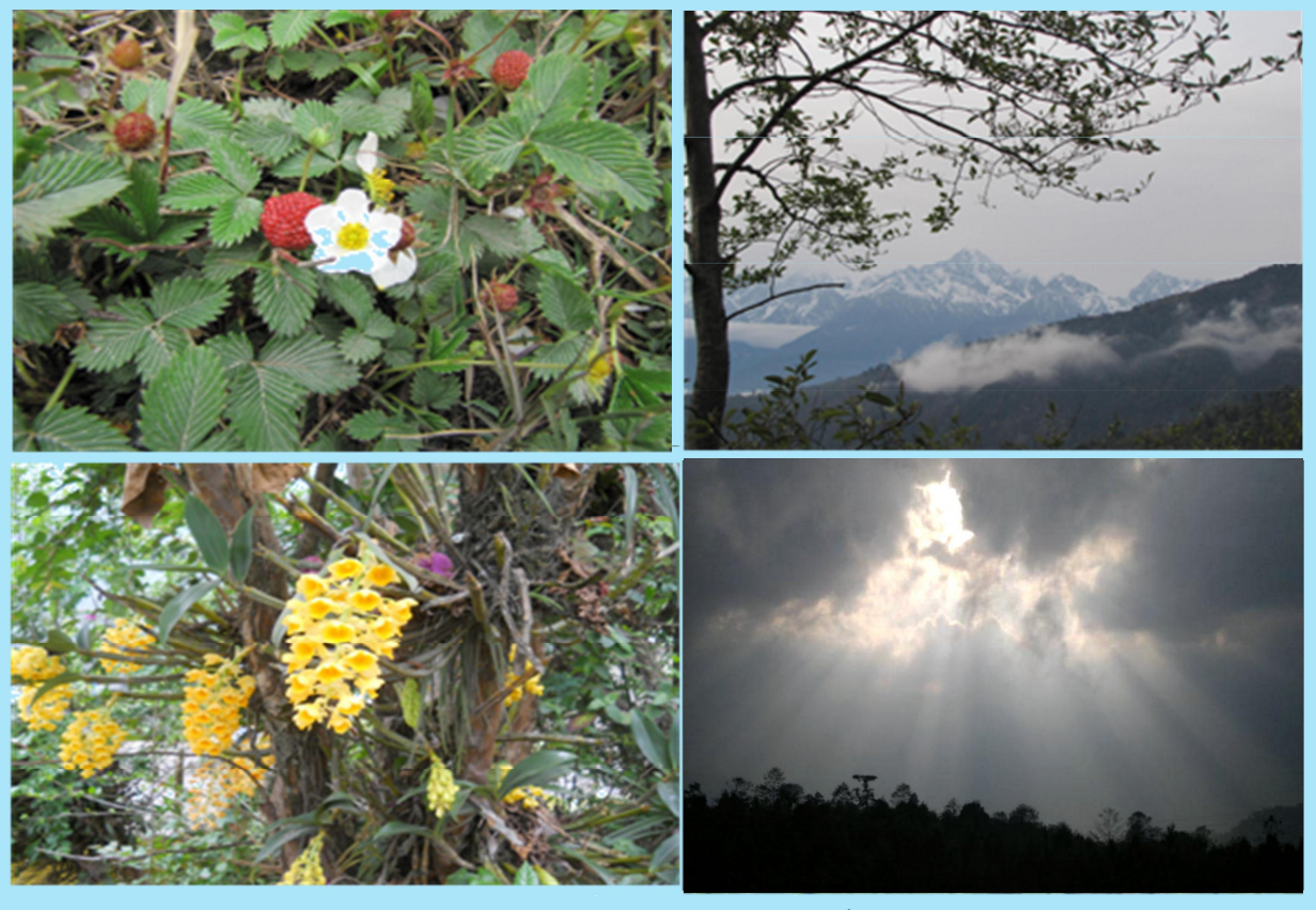
Nature at Ravangla