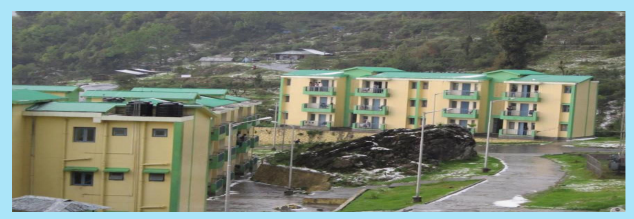
NIT SIKKIM: after snowfall